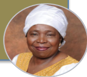
Dr Nkosazana Dlamini Zuma