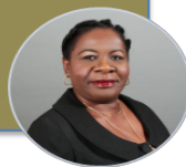
Luisa Diogo Deputy Chairperson of the AU Foundation